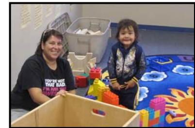
Skownan First Nation Daycare 2015