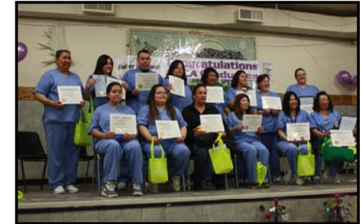
Peguis First Nation LPN Health Care Aide Graduation April 2015