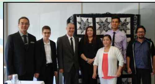
FPDI Cogmation Robotics Instructors 2015

Funding provided by Employment and Social Development Canada, Aboriginal Skills and Employment Training Strategy