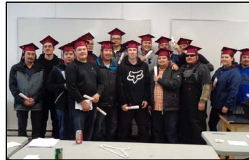
Sandy Bay Ojibway First Nation Carpentry Graduation January 2016